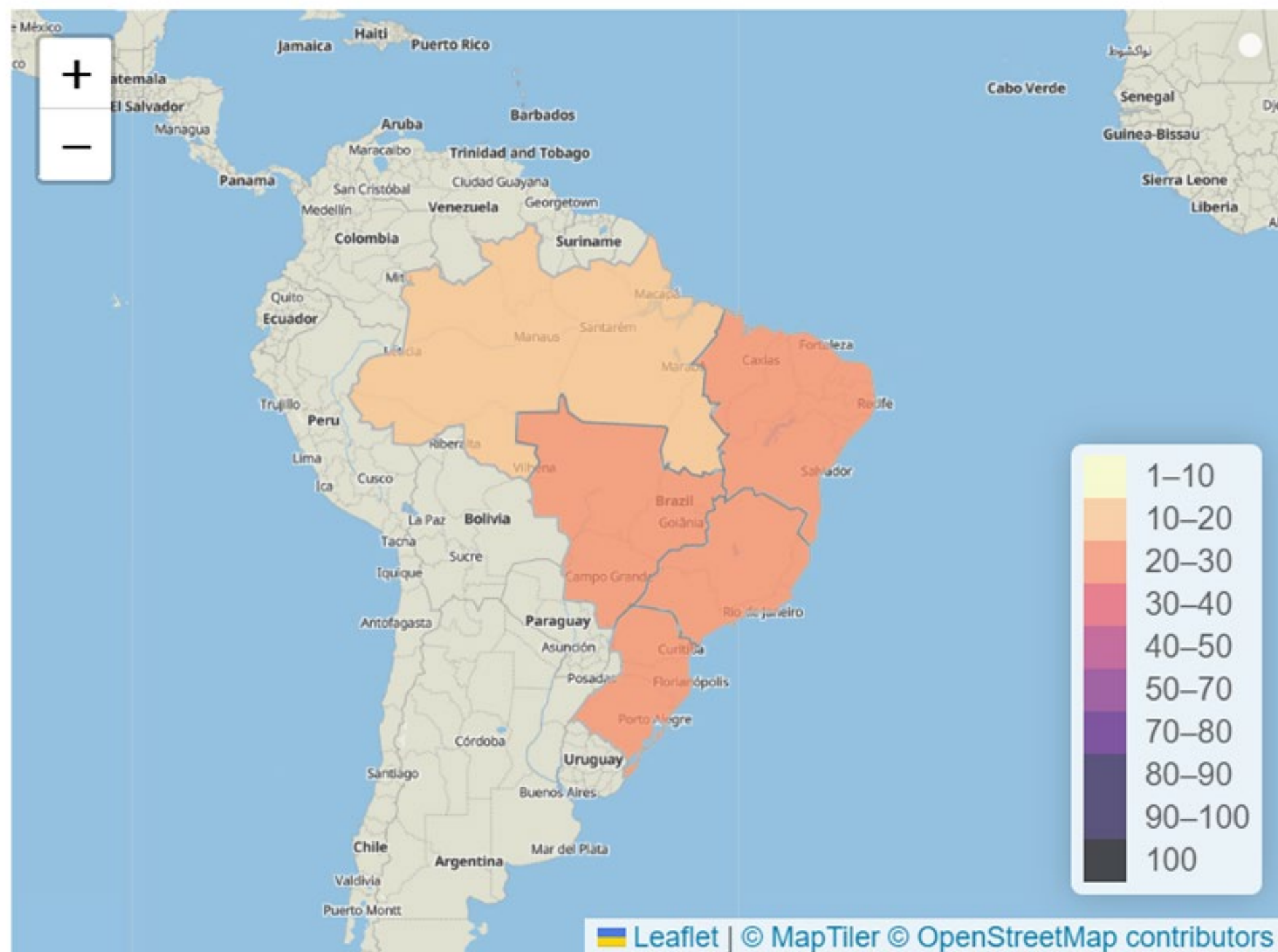
Consumo abusivo de álcool 1º Tri/2022