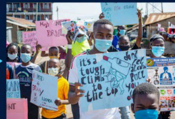
Child/ Youth Led Community Awareness Activities