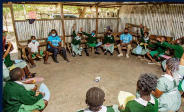
Children/ Youth Life Skills Lessons