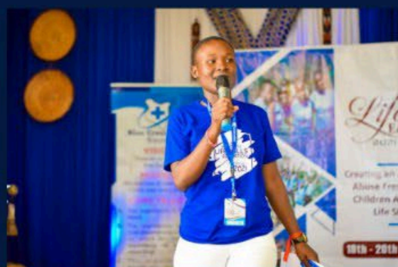
Children/ Youth Advocate Their Interest Before Duty Bearers