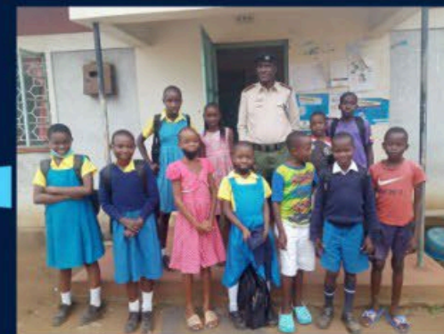
Children/ Youth Influence Decision Makers For Good Implementations Of Alcohol Policy