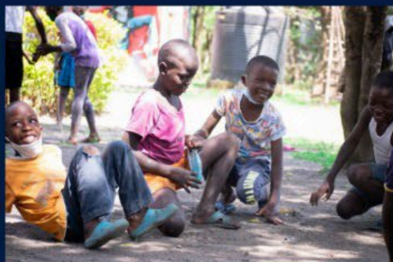
Children/ Youth Creating Safe Spaces